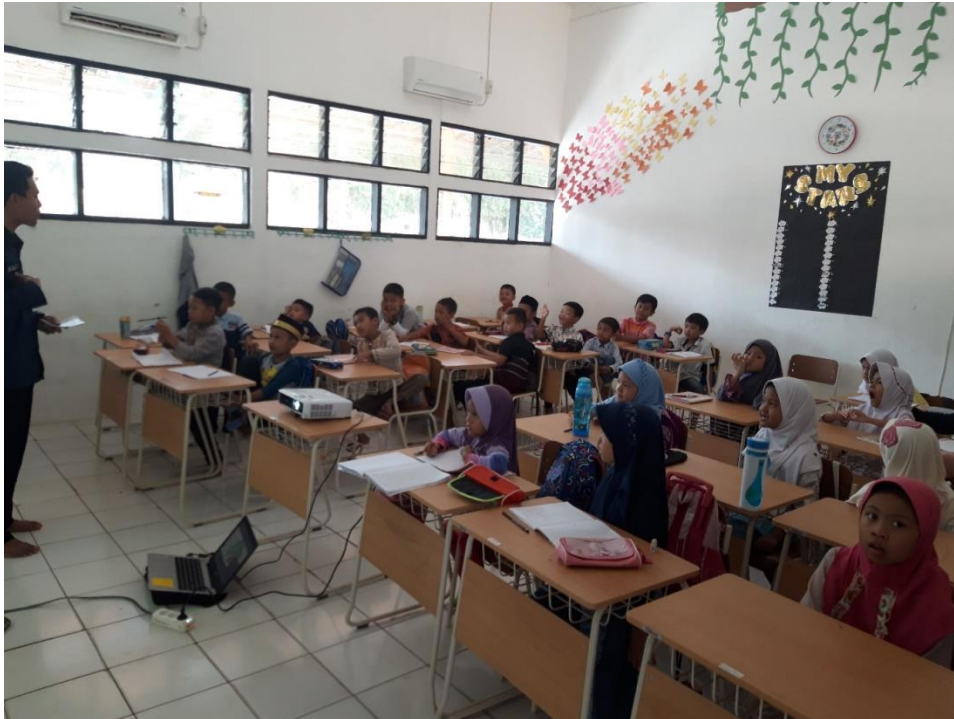
Figure 2. Digital literacy learning to Labschool UPI Purwakarta Elementary

School visual, auditory, and language abilities can improve in children after using educational applications on gadgets. The results of a study by Joan Ganz Cooney Center (in Wulandari, PY, 2016) said that five-year-old children using the iPad educational application experienced a vocabulary increase of about 27 percent, whereas in children aged three years, experienced a vocabulary increase of 17 percent . This shows the positive role of the application of educational games that can be applied to children.