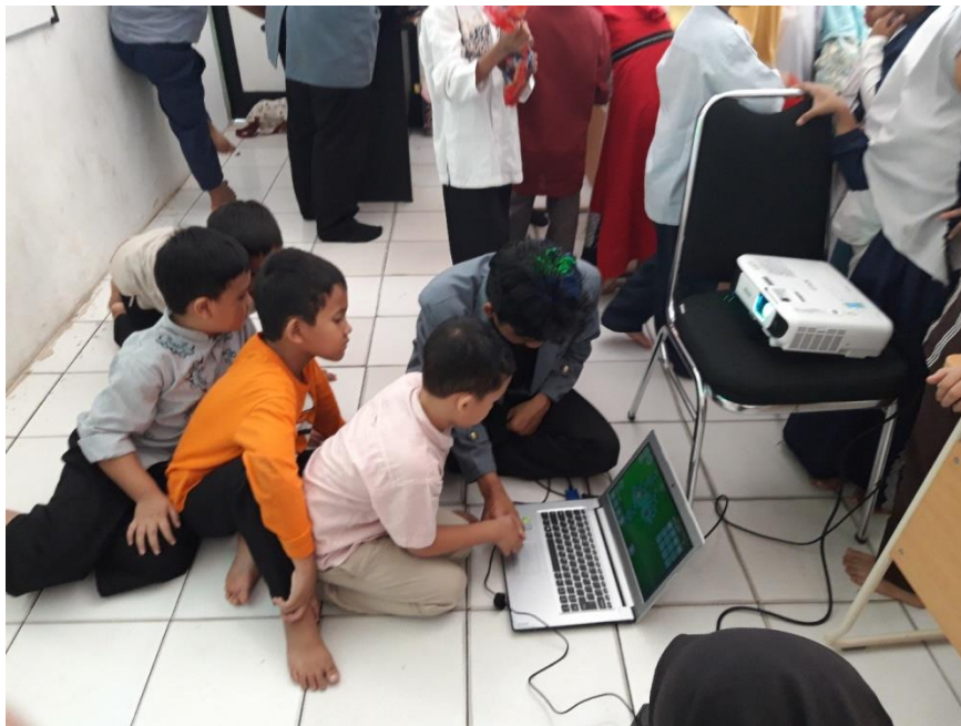
Figure 3. Children interest in operating to games education at Labschool UPI Purwakarta Elementary School

Children basically like games, because interest in a game is very high compared to other aspects. Play is a world of children that cannot be replaced by other aspects. In the case of children who prefer to play gadgets than other jobs is because in the gadget has an attraction, so the child does not want to be separated from the influence of the gadget.