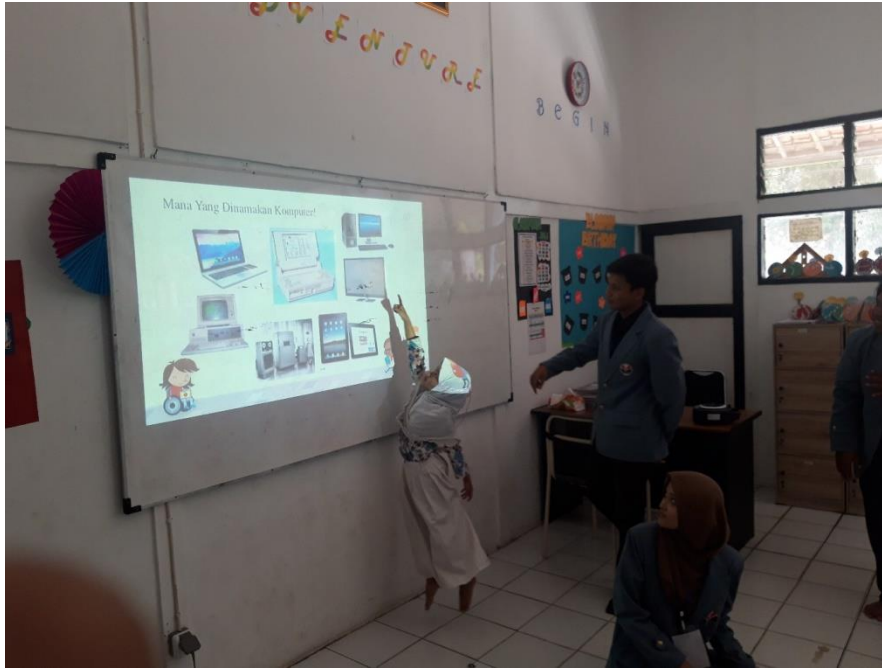
Figure 4. Some students try to answer simple question on digital literacy at Labschool UPI Purwakarta Elementary School

Mobile game is a game that can be run on a cell phone or cellular, so users can play it portable. Mobile games can be grouped into three categories: the first is embedded games, games that are already embedded in mobile device systems (Shiratuiddin & Zaibon, 2010). The second is the SMS game which is often in the form of live contests and polls. Types of mobile games can be classified as follows: Arcade / Action for example Doom and Alien; Sports for example bowling, golf and soccer; Skills, strategies and logic, for example Sudoku; Cartoons and boards, like a monopoly; Role playing games for example final Literacy skills which include listening, speaking, reading and writing are the foundations or determinants of the success of student learning activities. As a skill that underlies other skills, literacy learning needs to get serious attention