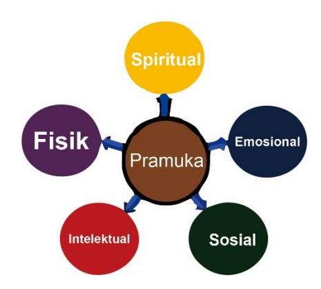
Figure 1.0 Achievements of the Scout Movement

The efforts and endeavors made by the Scout Movement, as stated in point g of article 10 of the Bylaws, namely fostering leadership attitudes through scouting activities. Many scouting activities influence leadership attitude factors. Examples of scouting activities that influence leadership attitudes are marching, camping, team and unit leader rehearsals, and ceremonies. Through these activities, children will be taught leadership attitudes (Anggaran Dasar Dan Anggaran Rumah Tangga Gerakan Pramuka, 2018). Scouting extracurricular activities are activities that have many benefits for children. Through extracurricular activities, scouting can instill good attitudes and personality, such as leadership attitudes. Students who participate in the entire series of activities arranged systematically will have leadership attitudes embedded in the students' souls. In Scouting extracurricular activities, it is hoped that they can achieve several aspects which can be the goal of implementing the Scout Movement, which can be seen in Figure 1.0