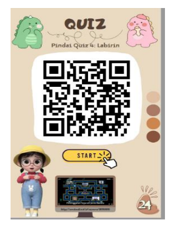
Figure. 2 E-book Design

According to material experts, the e-book provides complete material, material that is easy to understand and systematically arranged with interesting learning evaluations.