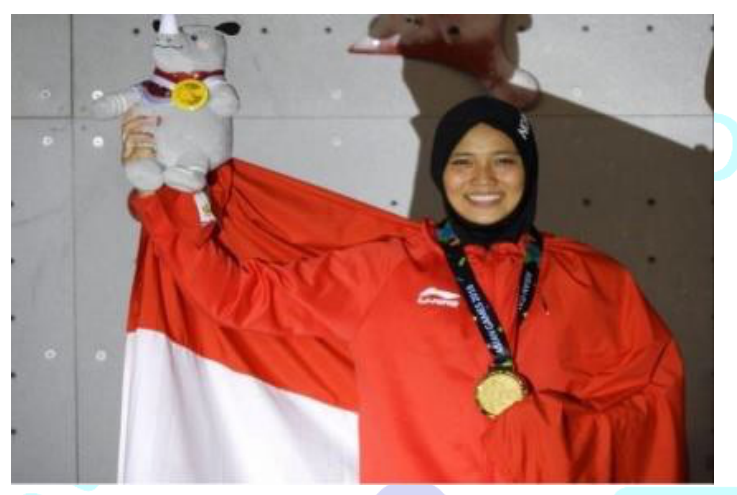
Figure 4. The gold medal at the 2018 Asian Games event. Source: Aries Documentation, 2018

Figure 3. Unyielding Spirit (I must the number one) Source: Aries Documentation, 2018