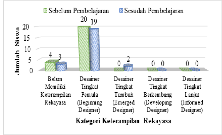
Gambar 8. Engineering skill category improvement in control group

The results of engineering skills grouping in the control group can be seen in Figure 8 below: