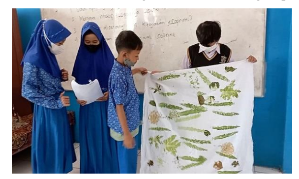
Figure 6. Product presentation

At the 4th meeting, there were other activities, such as presenting the results of the pounding technique eco print that each group had made and evaluating the work of other groups (Fig.6).