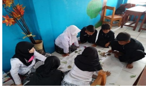
Figure 4. Meeting 3: Creating eco print using pounding technique

The activity is carried out in class and is an implementation activity of the pounding technique eco print motif design that students have designed.