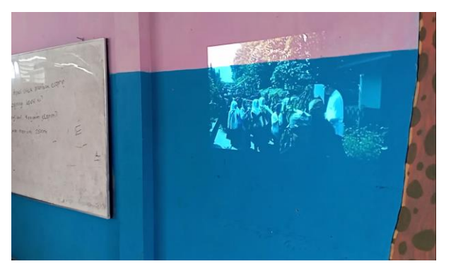
Figure 5. Watching Seba Nagri Video

At this stage, the teacher displays the impressions of "The Tradition of Seba Nagri Purwakarta". This show serves as a means of reflection on the learning activities carried out, namely reinforcing that nature is a blessing from God that we must protect and use wisely, such as in the manufacture of eco-prints with pounding techniques that can use natural materials. Thus it can minimize pollution due to synthetic materials commonly used in fabric factories.