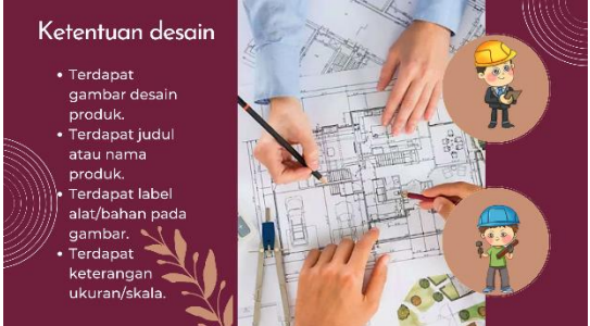
Figure 3. Design making criteria

In making the eco print design with the pounding technique, the teacher guided students to create a complete design, namely a design that meets the following criteria: