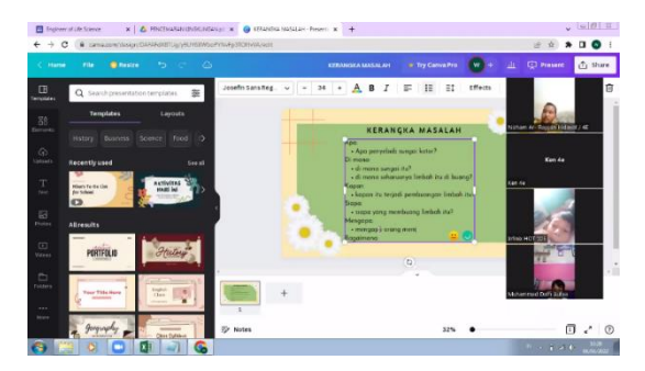
Figure 1. Meeting 1: Introducing problem

Learning activities are carried out online through learning websites, WhatsApp class groups, and zoom meetings. However, before the implementation of this 1st meeting, the researcher gave a worksheet and assigned students to watch the video challenge on the learning website. The activities carried out at the 1st meeting includes: 1) introducing problems, namely "Environmental Pollution Due to Synthetic Dye Waste"; 2) explanations of material about environmental pollution and reliable sources of information; 3) making problem frameworks and finding information to solve problems. Through this ask stage, students can practice engineering skills on indicators of understanding problems and indicators of building knowledge based on the results of a study. Then, there is an activity for students to imagine themselves as fabric entrepreneurs who care about the environment, which is the imagine stage.